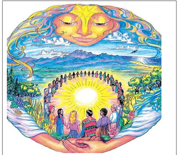
"Living in Harmony with Nature" Abbot's Mill Project from the Mother Earth Festival

This has been the year of groaning in my life. Perhaps you can relate. It has been a year of tension, navigating a shift in vocation, strained relationships, politically-induced stress every week, the heartbreak caused when our beloved denomination chose not to divest from fossil fuels, and action steps in the face of the catastrophic ecological crisis. I'm not sure if the groans